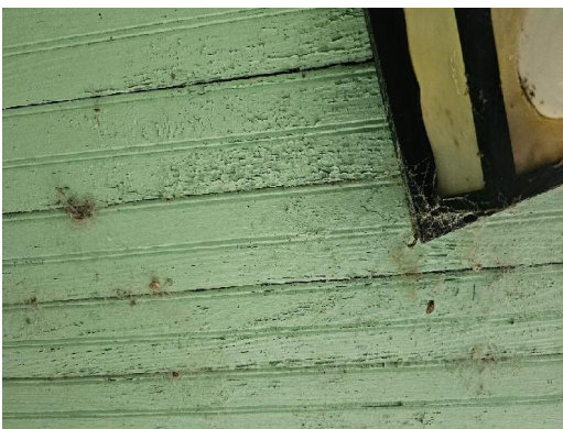
Exterior(008) B-Wall, Right Wood Porch Ceiling Lead-Positive, Deteriorated