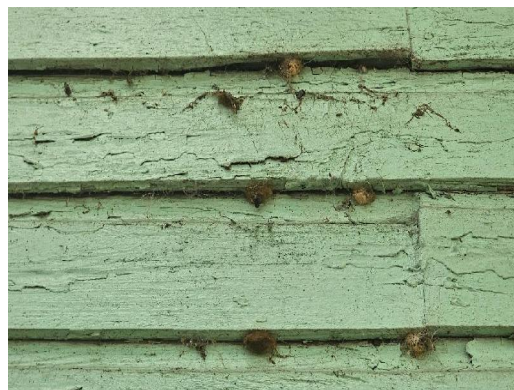
Exterior(008) B-Wall, Right Wood Wall Lead-Positive, Deteriorated