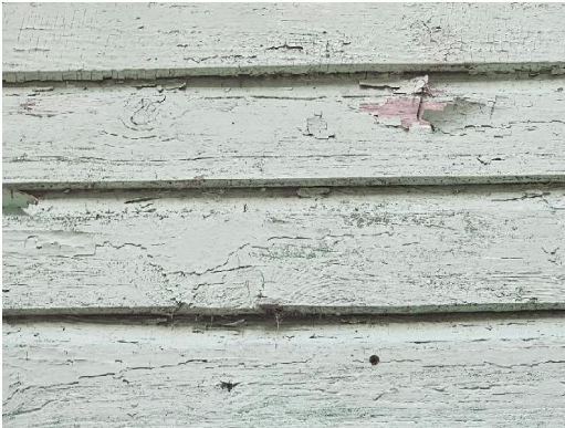
Exterior(008) D-Wall, Center Wood Wall Lead-Positive, Deteriorated